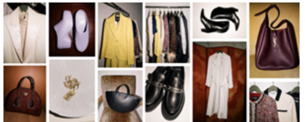
A sample of product consigned, courtesy of The RealReal